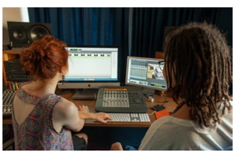
Sound studio