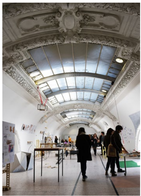
Glass roof, design option