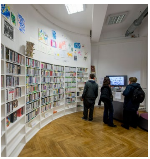
Audiovisual library © Franck Alix.