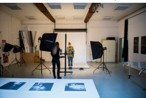
Photography studio © Franck Alix.

Introduction to the various techniques with basic materials for painting available: frame, paper, pigments, chalk, gesso, acrylic and oil binding agents.