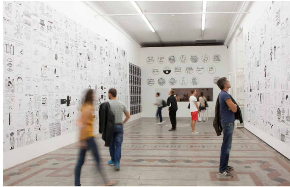
Top: Design-Dance workshop, open days © Franck Alix, march 2017 Bottom: Problem in Toulouse, David Shrigley exhibition, Printemps de septembre © Diane Arques, september 2016