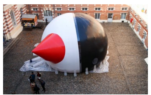
Workshop with Hans-Walter Müller © isdaT, november 2016.

Estelle Desreux +33 (0)5 31 47 12 51 communication@isdat.fr