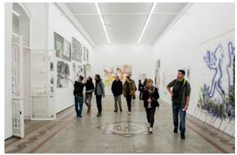
Palais des arts, exhibition space