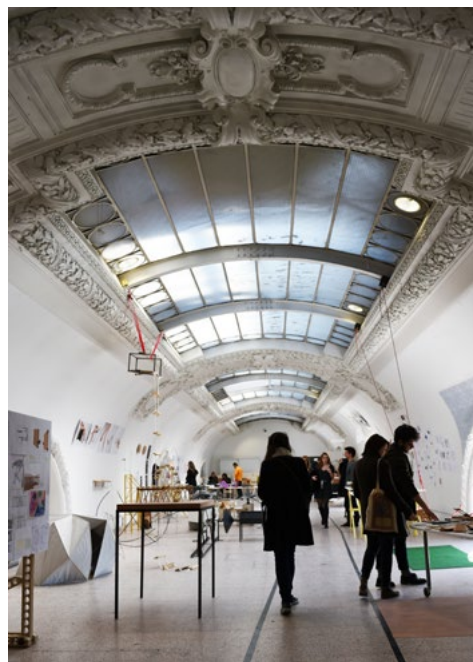
Glass roof, design option © Jean-Christian Tirat.