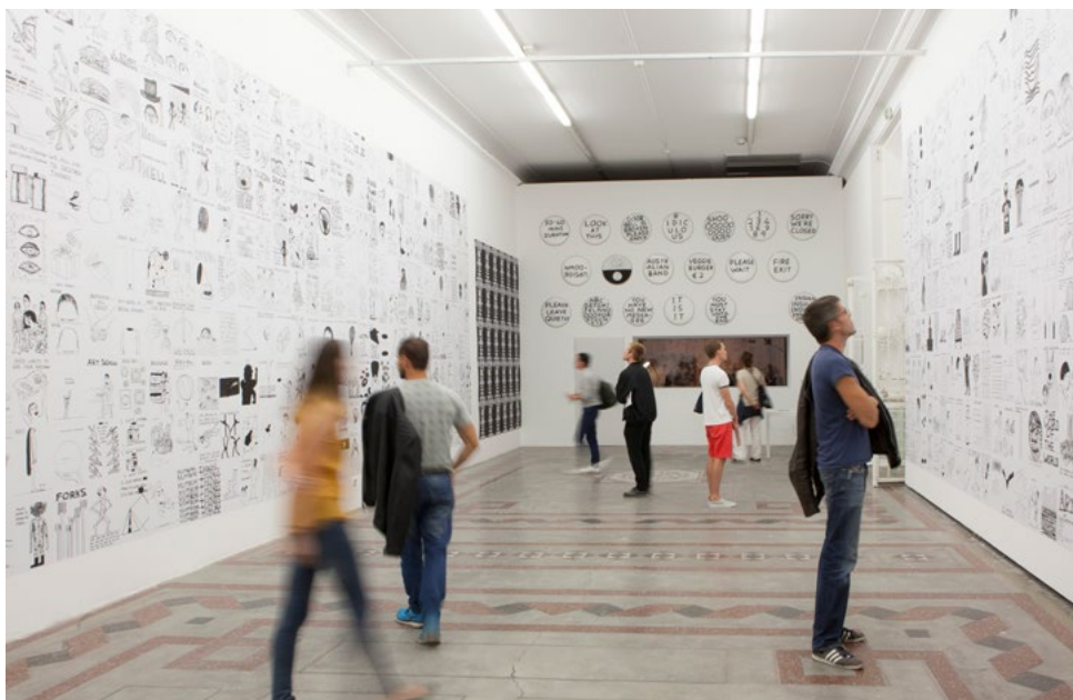
Top: Design-Dance workshop, open days, march 2017. Bottom: Problem in Toulouse, David Shrigley exhibition, Printemps de septembre, september 2016.