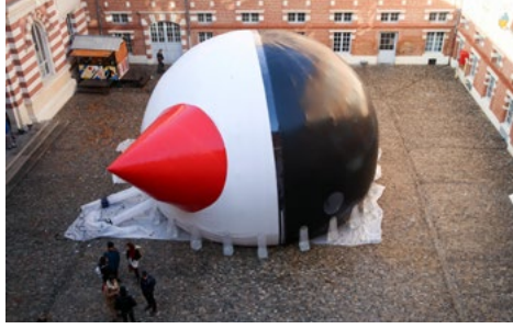
Workshop with Hans-Walter Müller © isdaT, november 2016.