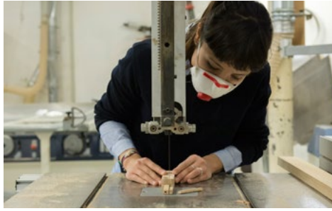
Wood workshop © Franck Alix.