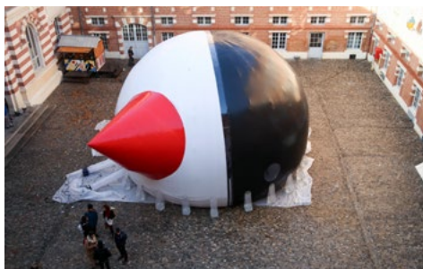
Workshop with Hans-Walter Müller © isdaT, november 2016.