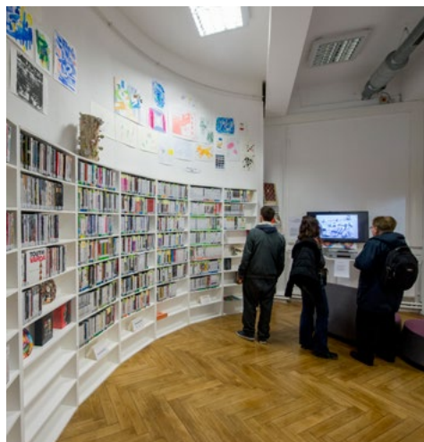
Audiovisual library © Franck Alix.