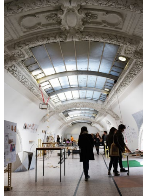
Glass roof, design option © Jean-Christian Tirat.