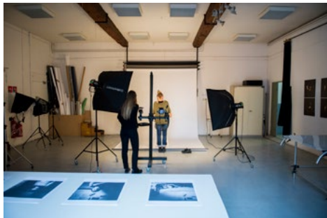
Photography studio © Franck Alix.