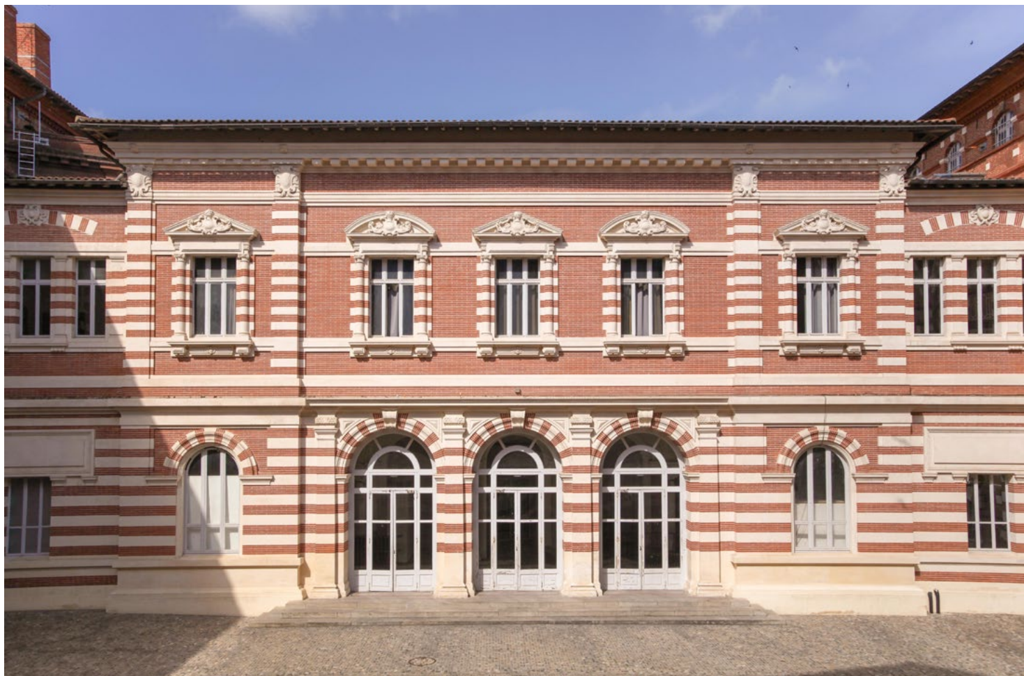
Main courtyard, fine arts department © isdaT, june 2017.

The institut supérieur des arts de Toulouse is a Public Institution for Cultural Cooperation organised into two departments that each have an autonomous curriculum. While the performing arts department trains musicians and dancers, the courses offered at the fine arts departments are organised into three options: art, design, and graphic design. Both departments are engaged in international partnerships and in an active cooperation with the artistic structures of the city and the region.