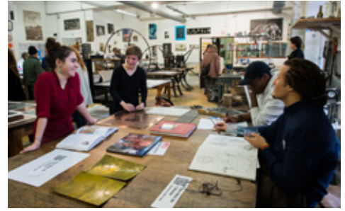
Engraving workshop © Franck Alix.