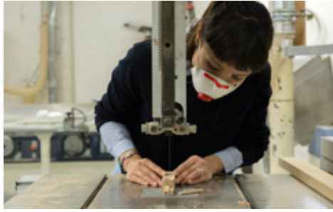
Wood workshop © Franck Alix.