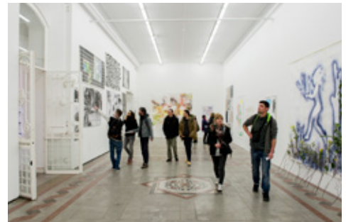
Palais des arts, exhibition space