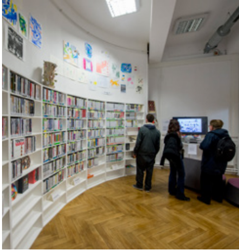
Audiovisual library © Franck Alix.