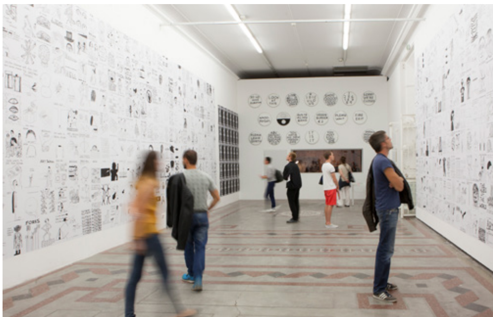
Top: Design-Dance workshop, open days © Franck Alix, march 2017. Bottom: Problem in Toulouse, David Shrigley exhibition, Printemps de septembre © Diane Arques, septembre 2016.