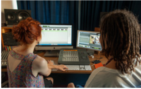
Sound studio © Christine Sibran.