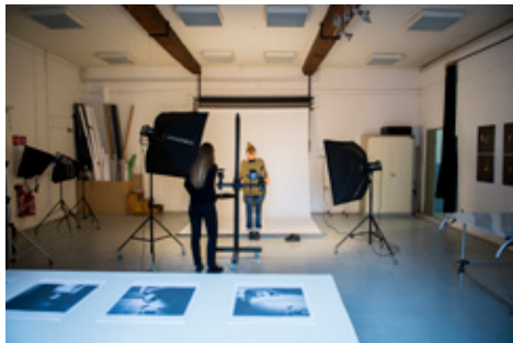
Photography studio © Franck Alix.