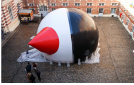
Workshop with Hans-Walter Müller © isdaT, november 2016.

Communications Estelle Desreux +33 (0)5 31 47 12 51 communication@isdatt.fr