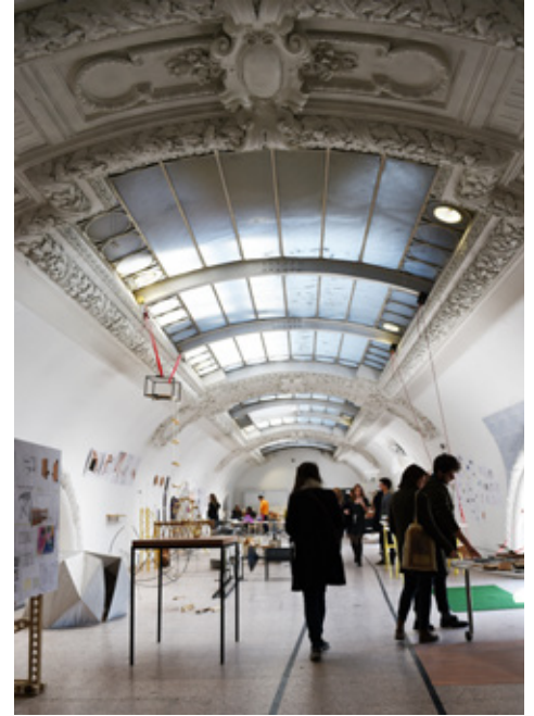
Glass roof, design option © Jean-Christian Tirat.